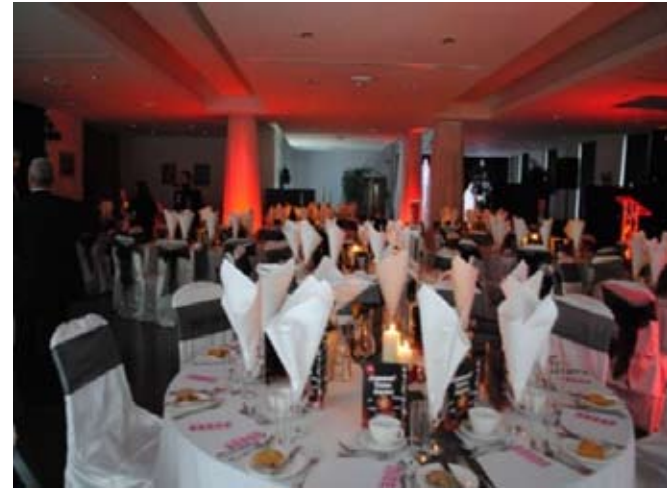
The Space, Students' Union Awards 2010